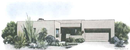
Elevation A (with casita)